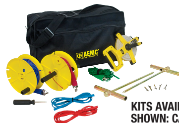
KITS AVAILABLE SHOWN: CATALOG #2135.35